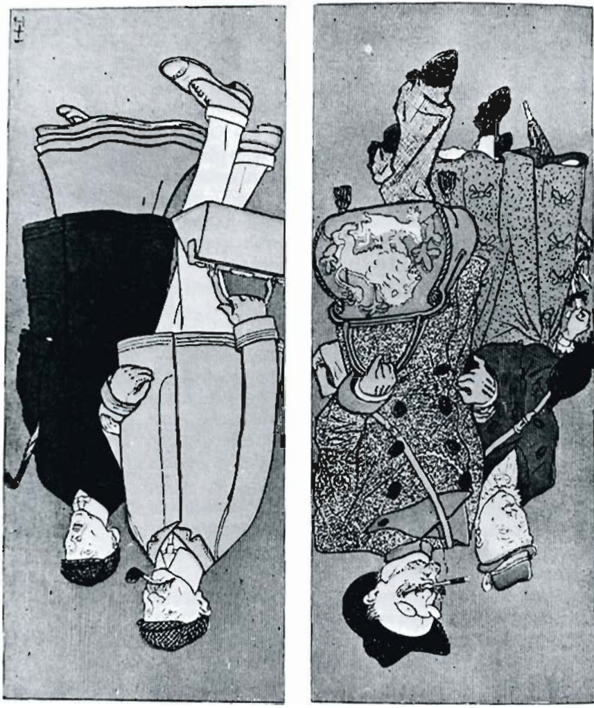
8 Cartoon by Theodore Thomas Heine contrasting German and English fashions. Caption for the image at left: "Herr and Frau Schmidt look like this when they travel to London"; for the image at right: "And like this when they return after a week here as Mr. and Mrs. Smith." From Simplicissimus: Illustrierte Woehenschrift, Munich, 1902.